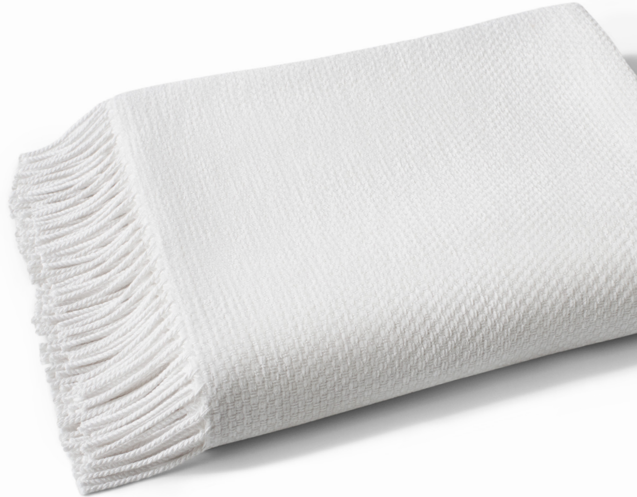
NAPA FRINGE IN COCOON SWAN