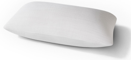
KNIFE EDGE LUMBAR