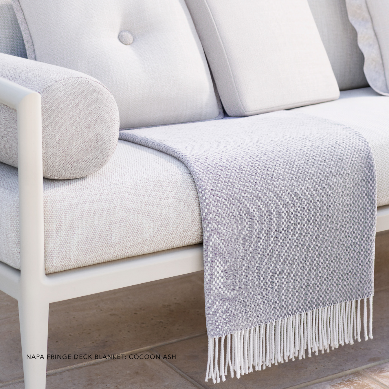
NAPA FRINGE DECK BLANKET: COCOON ASH