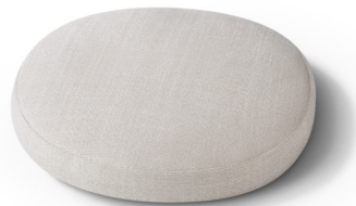
BOXED EDGE ROUND