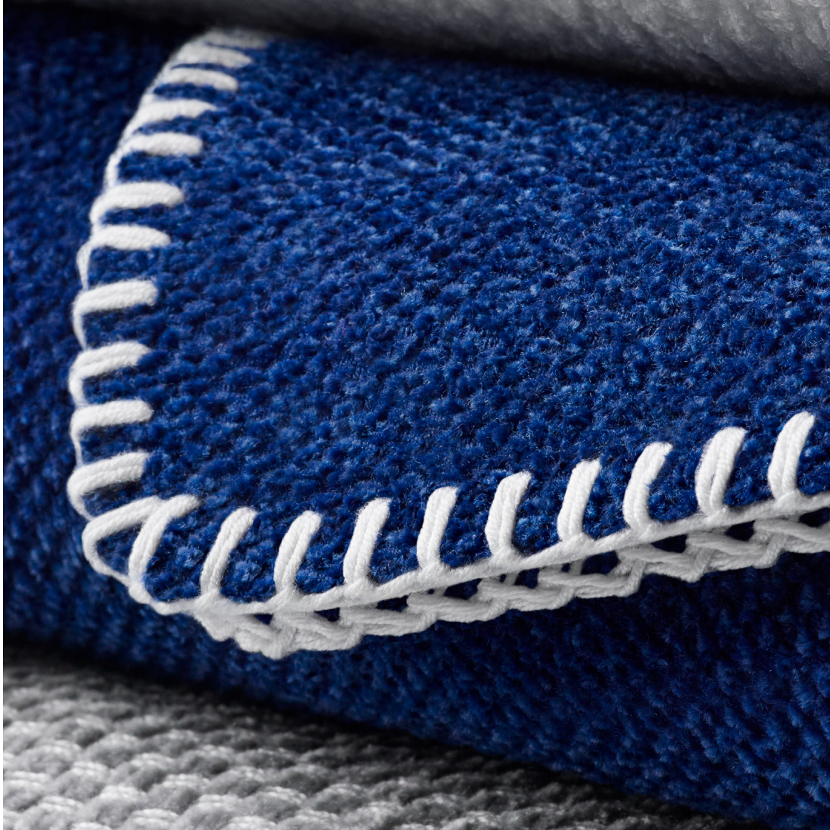
TEDDY BEAR LAPIS WITH SWAN POLO STITCHING

Our Deck Blankets with Polo Stitching are carefully crafted with robust, rustic blanket stitching on the full running edge, a signature detail that gives our blankets an eye-catching accent in a timeless design.