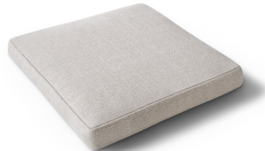
BOXED EDGE SQUARE