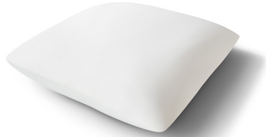
KNIFE EDGE SQUARE